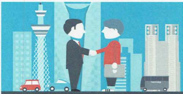
Leveraging the strengths of the location of Haneda Airport close to the city center, the international competitiveness of the Tokyo metropolitan area will be enhanced through creating a good business environment

Increasing international flights at Haneda Airport will widen the range of business and travel, thereby energizing not only the metropolitan area but also the whole country. It is expected to attain annual economic ripple effect of approx. 650.3 billion yen and increase employment by approx. 47,000 through activating the flow of people and goods.