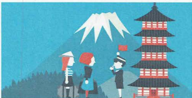
Domestic consumption will be vitalized by a lot more foreign tourists