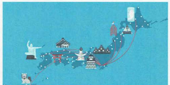
Local regions in Japan will be activated by connecting the domestic aviation network extending from Haneda Airport with international flights