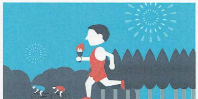
Smoother access to Tokyo from overseas will help successfully hold the Tokyo Olympic and Paralympic Games